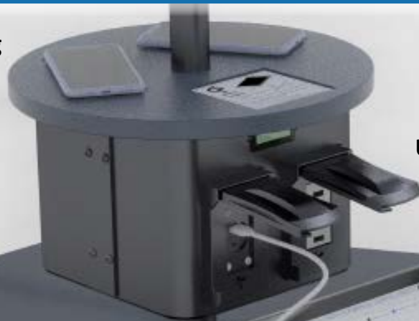
USB Charging Ports