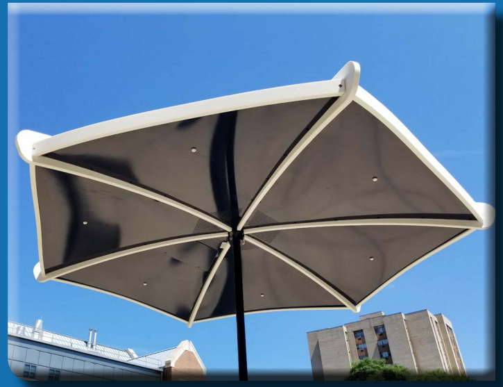
LED Canopy Lights